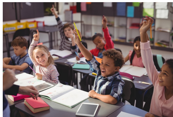
Elementary Classroom Focus